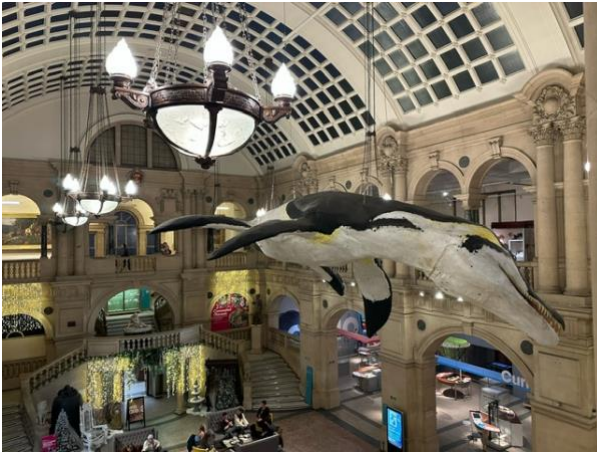
Pliosaurus in the Natural History Collection