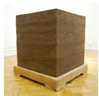
A Ton of Tea by Ai Weiwei

We also enjoyed the art gallery which had a few lovely pieces and lots of otherwise interesting pieces. One of the art exhibits was called "Ton of Tea". I thought it was a block of stuff left on a pallet by the builders to be used later as a plinth for another exhibit!