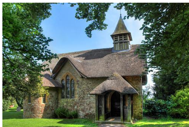
Church of St George, Langham

Our next church visit will be on Thursday 21 November, when we shall go to the Church of St George in Langham and St Nicholas Church in Silton. The first is the only thatched church in Dorset, a WWI memorial chapel, and the second is Grade 1 listed, dating back to the 13th century. We will meet at 10.30am at St George's, which is in Queen Street, Langham, SP8 4DX, for a tour of approximately one hour.