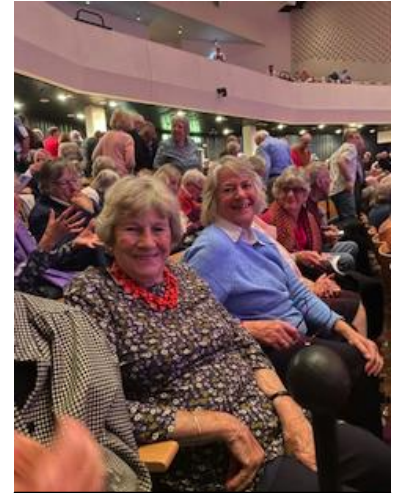
Happy concert goers

confirmation, if confirmation were needed, that we are incredibly fortunate to have a world-class orchestra so nearby.