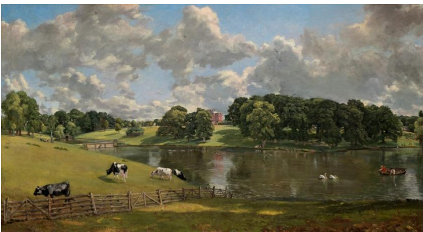
“Wivenhoe Park” by John Constable (1776-1837)